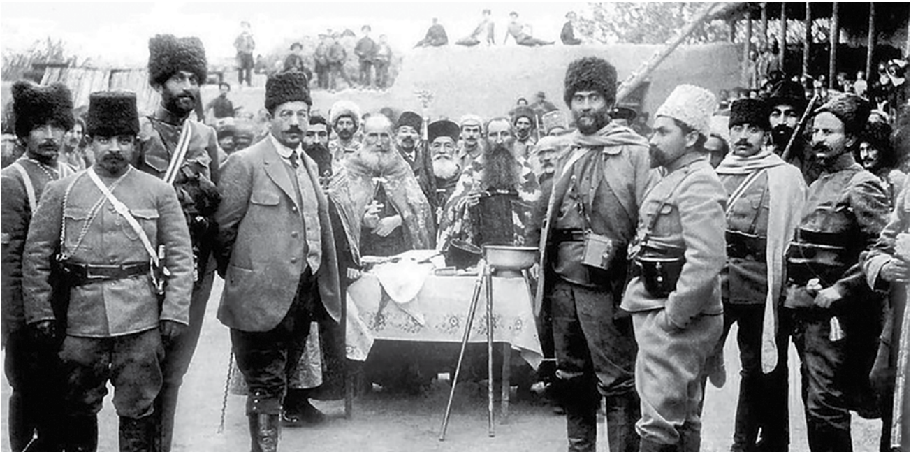
Dro (third from the right) heading Armenian detachments on the Turkish front. 1915. The Entente countries supplied Armenian detachments with uniform, weapons and food

According to the memorandum, the most realistic option for making France give up the Sykes-Picot Agreement was to give it the mandate over Armenia and the South Caucasus. The main purpose was to redirect France to the north and keep it away from the regions that were within the British sphere of interests. The memorandum also said that France would have a mandate over Armenia and the United States over Georgia and Azerbaijan (9). However, Lord Curzon said the following about the French mandate at the 40th meeting of the Eastern Committee of the Military Cabinet on 2 December 1918: “Will France take such a kind of responsibility in the Caucasus? On the other hand, is this a proper choice for us? Eventually, is this appropriate to our interests to process the potent France into a power authority at this region?” (8, p. 17)