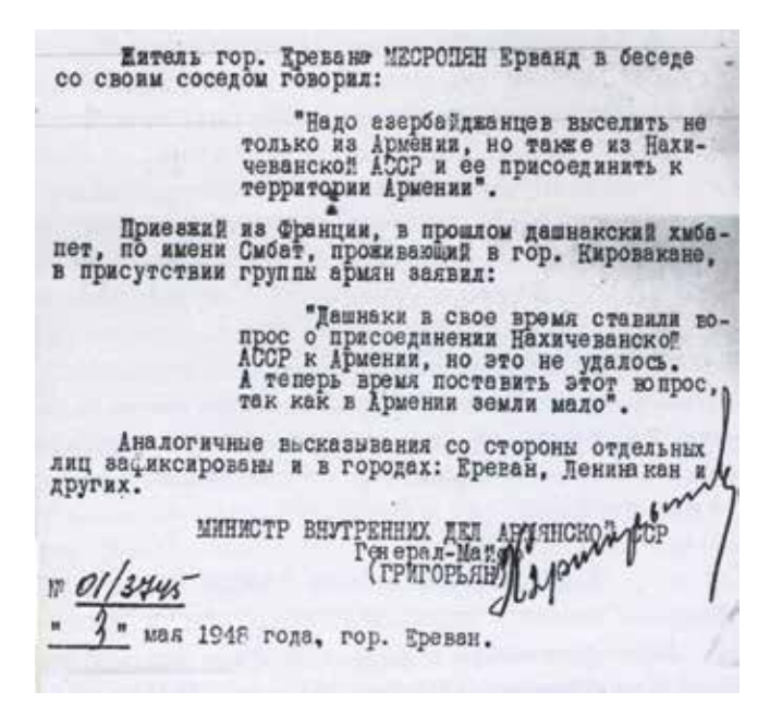
Report showing the reaction of the Armenians to the deportation of the Azerbaijanis from Armenia

on this subject is contained in a memorandum from the chief of the Migration Department under the Council of Ministers of the Azerbaijan SSR, N. A. Brutents, to the chairman of the Council of Ministers of the Azerbaijan SSR, T. Guliyev, on 15 March 1948 on the situation of families resettled from Armenia to Ganja and its districts in December 1947 and in early 1948. The note says that settlers, about 50 families, are mostly living in the village of Yeni-Yerevan. Before the arrival, most of them worked in the system of the Ministry of Trade and Public Catering of Armenia so due to the lack of work, they were jobless.8 On 23 November 1949, the chairman of the Executive Committee of the Vedi District Council, A. Mammadov, informed the chairman of the Council of Ministers of the Armenian SSR that in 1948-1949, more than 700 Azerbaijani families moved to different regions of Azerbaijan without permission from Vedi District alone9. To prevent such unorganized resettlement of Azerbaijanis from Armenia, in a telegram to the chairmen of district executive committees and secretaries of district party committees of Azerbaijan on 3 March 1948, the chairman of the Council of Ministers of the Azerbaijan