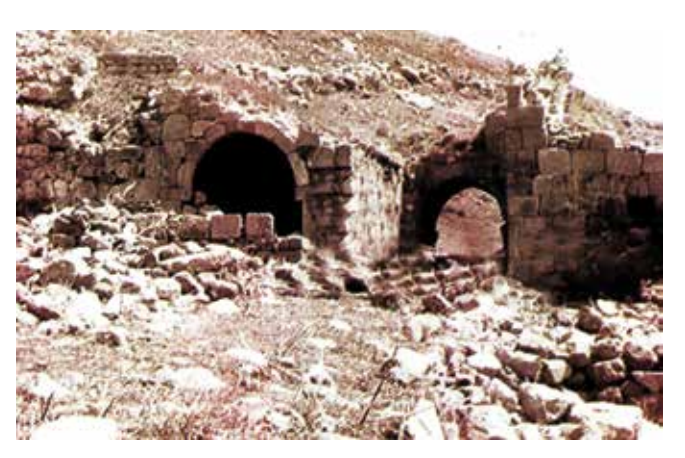
Ruins of the Irevan fortress