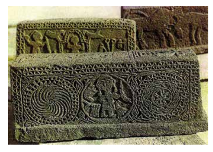
Azerbaijani tombstones in Urus village

3. Гасанли Дж.П. СССР-Турция: от нейтралитета к холодной войне (1939-1953). М., 2008, с. 278