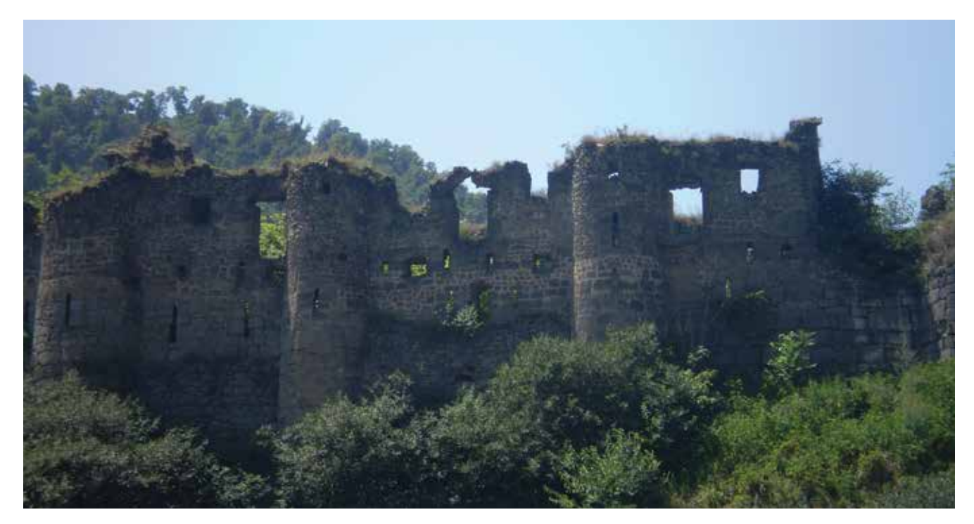
Fortress Agtala. Lori mahal of the Irevan khanate (nowadays - the Tumanyan area Republic of Armenia)

and cultural conditions. Numerous examples about the disadvantaged situation of settlers are listed in notes of the Republic's Resettlement Department sent to the Council of Ministers of the Azerbaijan SSR. They show that in the Azerbaijan SSR, compatriots were not received with outstretched arms. For example, in August 1948, 131 families (570 people) were resettled to Martuni District in Nagorno-Karabakh. However, the settlers ended up in extremely difficult conditions. The leaders of the region ignored signals and complaints from settlers about their difficult living conditions. District organizations did not provide the settlers with their benefits and pensions for war veterans, mothers with many children and disabled veterans of the Great Patriotic War. School and cultural services for migrants were in a poor condition.<sup>19</sup> As a result, under the pretext of internal resettlement, 132 households, 529 Azerbaijanis were evicted from the NKAR to Khanlar District in 1949.<sup>20</sup> Thus, the Azerbaijanis were evicted from the NKAR, although in the 27 May 1949 report by the chief of the Resettlement Department of the Council of Ministers of the Azerbaijan Republic, it was proposed to resettle the population to Mardakert