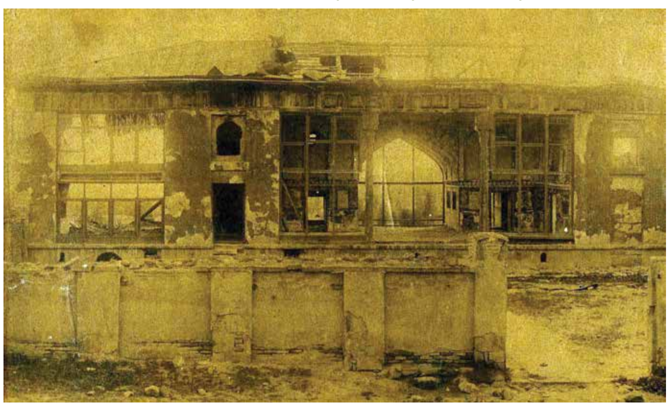
Destruction of the Palace of Irevan khans, irrefutable historical evidence

Stalinist repression in the second half of the 1930s and resumed its activities in 1945. In 1945, the new Armenian Catholicos George VI Chorekchyan appealed to Stalin on behalf of the Armenian people: "We have great hopes that the government and diplomatic wisdom of the Soviet Union will find means and ways to eliminate this injustice, which our people suffered during World War I." On 21 November 1945, the Soviet government issued a decree allowing the mass repatriation of Armenians to Soviet Armenia, in which the church was given the role of a link between Armenia and the Diaspora. In this connection, on 27 November 1945 the Armenian Catholicos issued an appeal to the religious leaders of the Diaspora, who had "particularly important responsibilities to use their authority, skillful tongue and impressive speech" to promote the success of this campaign. The Armenian Catholicos addressed the heads of the three great powers - the Soviet Union, the US and Britain, asking them to put pressure on Turkey so that it returns 'Armenian territory' to Soviet Armenia." Many Armenians from Iran, Syria, Iraq, Egypt, France, Greece, America, etc. (about 100,000) believed the promises of a prosperous life when moving to Soviet Armenia. However, Arutinov