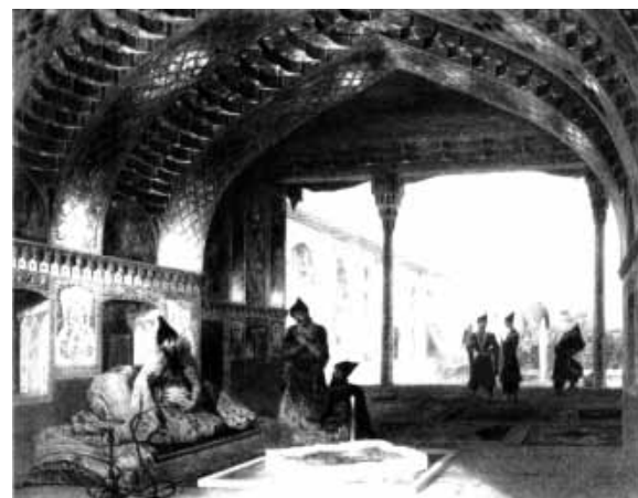
A sample of Azerbaijani architecture of Erivan. "The residence of the Erivan Khan." Artist Prince G. Gagarin. The 1840s

The Provisional Government, which came to power in Russia in February 1917, and the Bolsheviks, who succeeded them later in October of the same year, showed full loyalty to the policy of Tsarist Russia on the Armenian issue, which was reflected primarily in attempts to create autonomy for the Armenians from Ottoman territories. However, after the government of the Transcaucasian Commissariat concluded the Erzincan truce with the command of the Ottoman army at the beginning of December 1917, which initiated the process of the withdrawal of Russian troops from the Caucasus front, the hopes of the Armenians began to crumble. The further development of the regional situation and, in particular, the Treaty of Brest-Litovsk signed on 3 March 1918 between Rus-