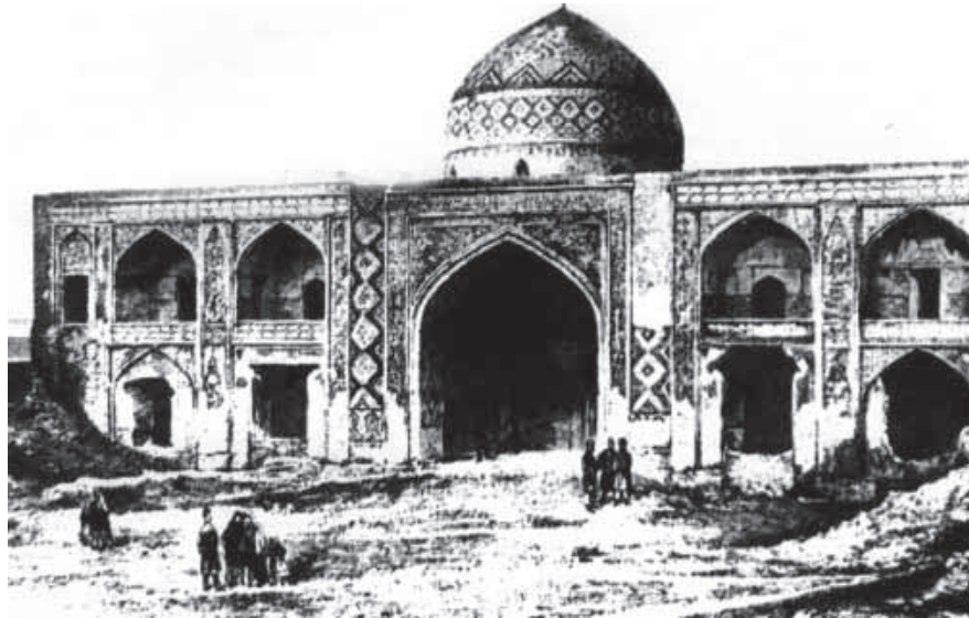
A sample of Azerbaijani architecture of Erivan. “The Sardar Palace in Erivan”. Artist Prince G.Gagarin. The 1840 s